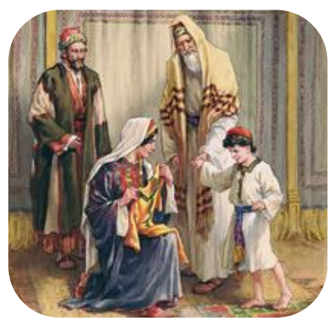
1 Samuel 1:9-18 and 1:20-28 (whole story 1 Samuel 1-3)