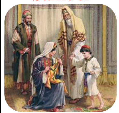
1 Samuel 1:9-18 and 1:20-28 (whole story 1 Samuel 1-3)